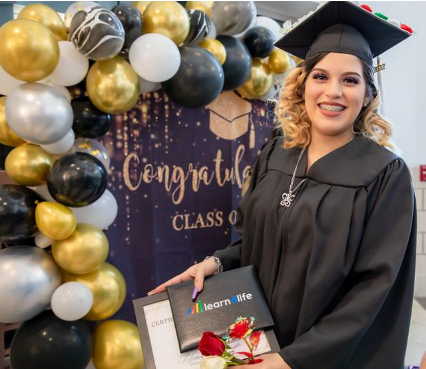
2022-2023 Goal 3 College and Career Readiness Baseline and Targets

Lone Star Governance Goal (LSG) 3: The College, Career, and Military Readiness raw score (% of graduates who met the CCMR standard) will increase from 43 percent to 85 percent by June 2027 (Baseline CCMR measure June 2022).