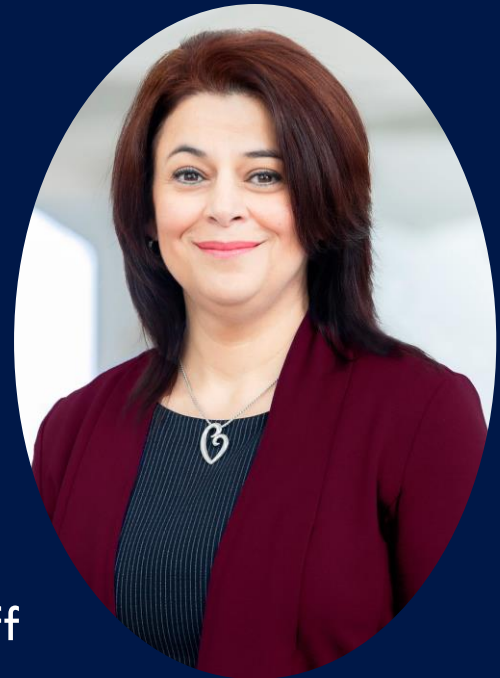
Chief of Staff