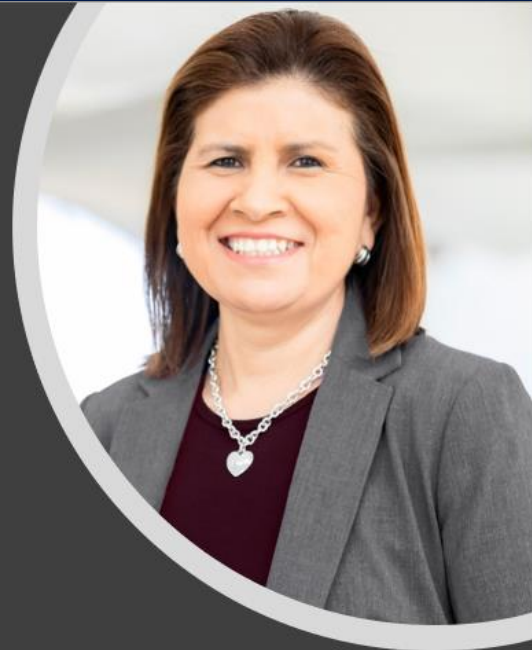
Human Resources & Student Services