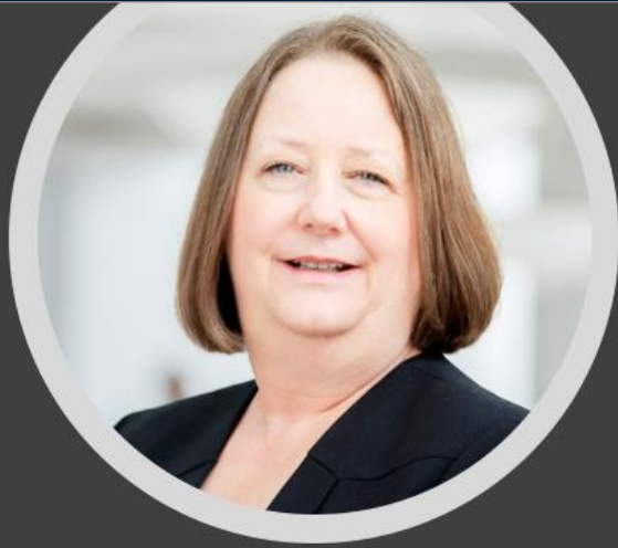
Business & Finance