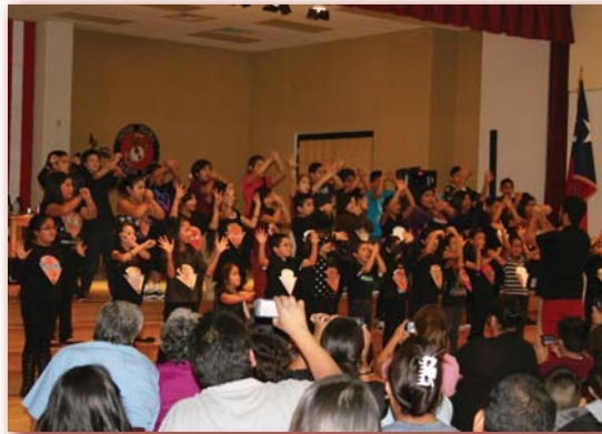
Parents and employees enjoy the song and dance performance by the Roy Cisneros ES Choir.