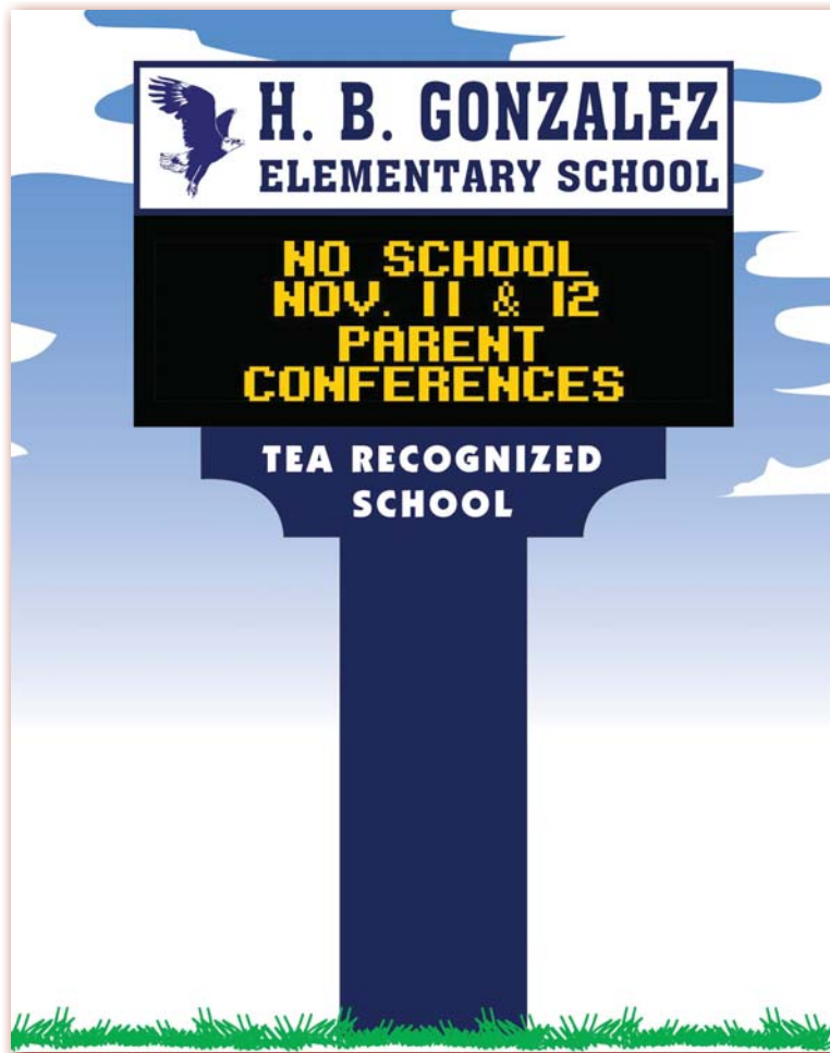
This is a rendering of what the new school marquees might look like. The final design is pending.

The marquees are for the 10 elementary campuses, three early childhood centers, three middle schools, and two high schools. The new scoreboard at Mata Stadium will have LED video display.