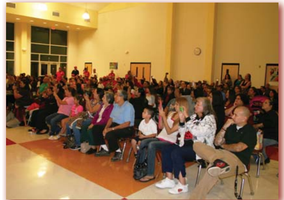
Parents and family members take photos and video of the Roy Cisneros ES Choir performance.